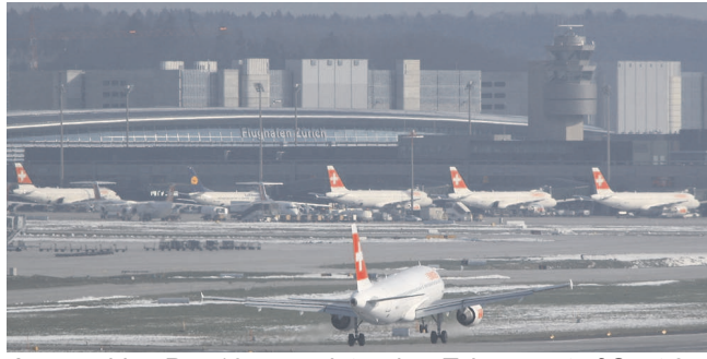
Approaching Rwy16 on a winter day. Taken west of Spot 8

Zurich Airport is located 10km north of the city of Zurich and is Switzerland's biggest and busiest airport. It is a favourite of many photographers, as it offers good traffic and some attractive and easily accessible photo spots.